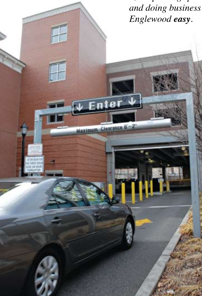
Dean Street Garage entrance

2,000 parking spaces make visiting and doing business in downtown Englewood easy .